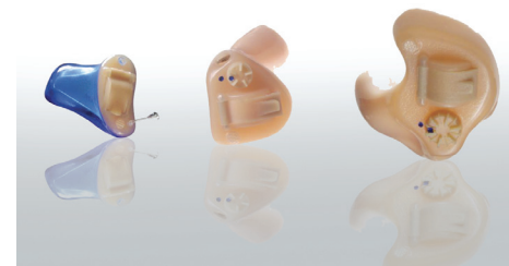
The Ligerio family of products is available in all custom styles.